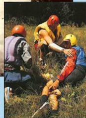
The snake bite